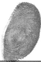
LEFT THUMB PRINT