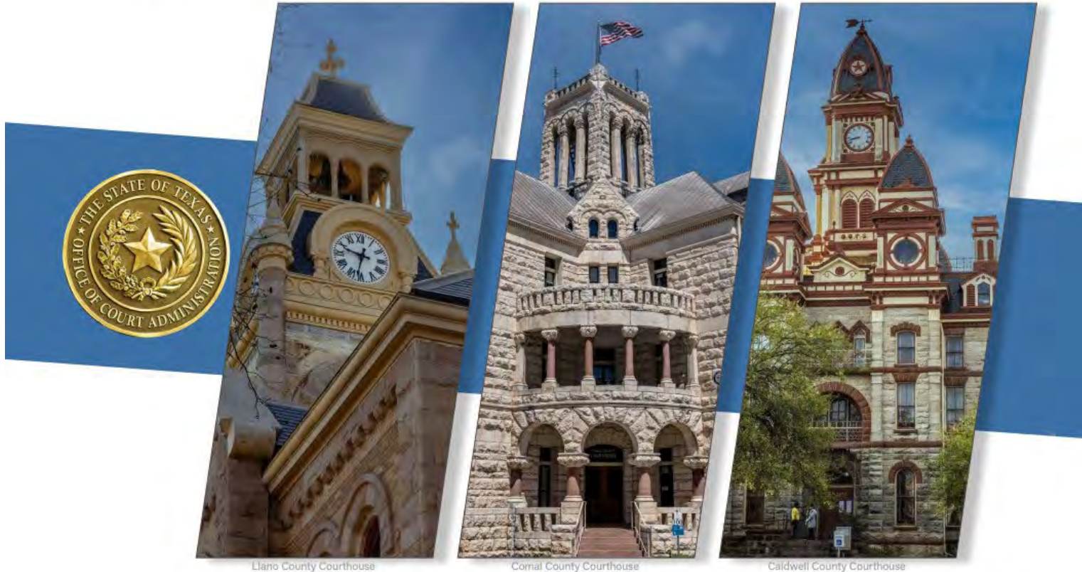
Llano County Courthouse

SUBMITTED TO THE OFFICE OF THE GOVERNOR, BUDGET DIVISION, & THE LEGISLATIVE BUDGET BOARD