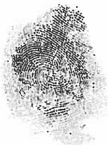
Defendant's Right Thumb*