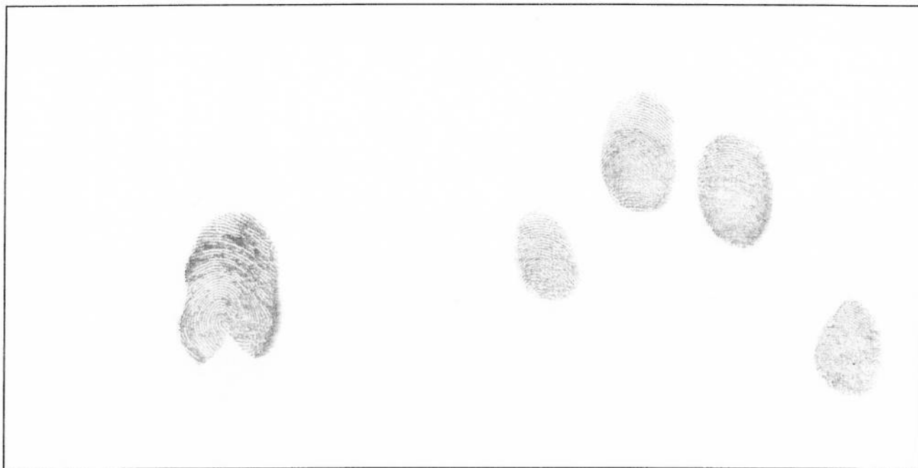
Defendant's Right Thumb